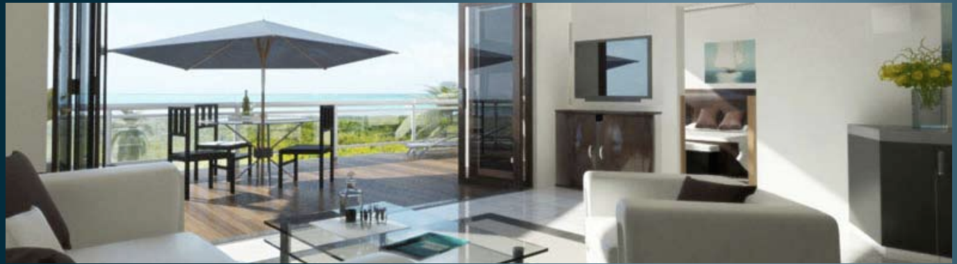
Computer generated images of the lounge and terrace

counter tops, cooker range, dishwasher, washer & dryer, plasma TV, 2 full bathrooms fitted to the highest standards, together with a superb communal pool and relaxation area.