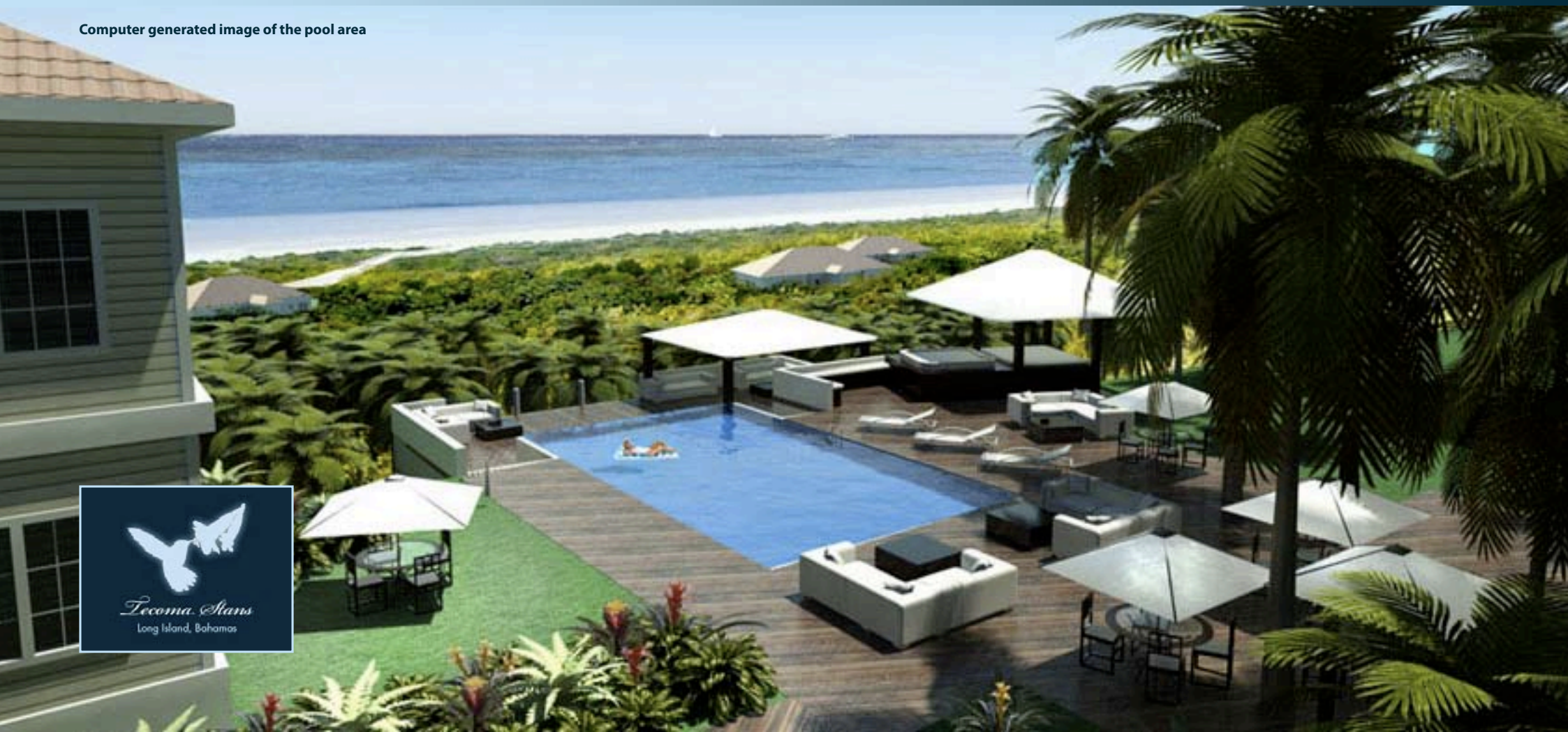
Computer generated image of the pool area