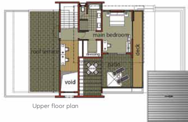
Upper floor plan

(Gross area not inclusive of uncovered decks, but includes wall thickness)