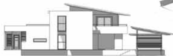
typical side elevation