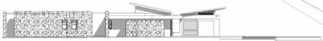
typical side elevation