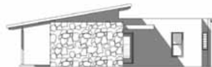
side/ entry elevation